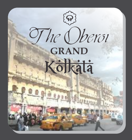
22 to 24 February 2017

The three day international summit was organised at The Grand, Kolkata in West Bengal, India .